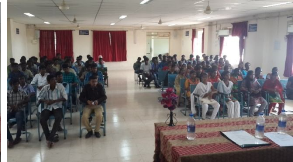
Tourism Day Celebration 2014-15, 2015-16 & 2016-17