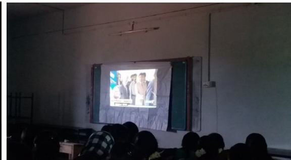
Kargil day Celebration 2019-20