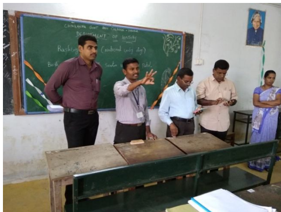
National Integration Day Celebration 2014 & 2018 (Vallabhbhai Patel birth anniversary)