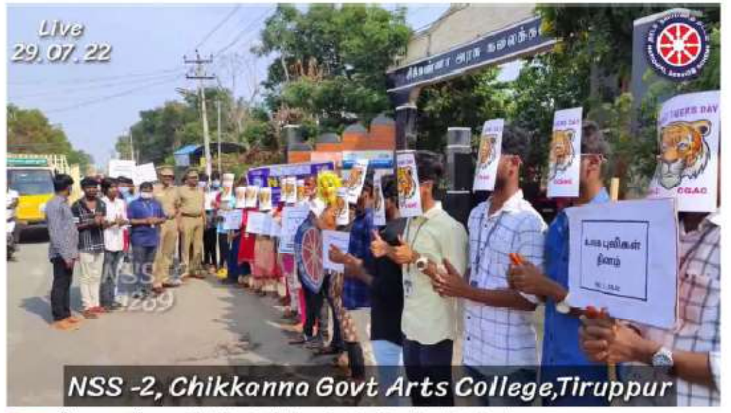
ாigers புகி வருது புகி வருது | World Tigers Day|Chikkanna Govt Arts College| Bharathiar University