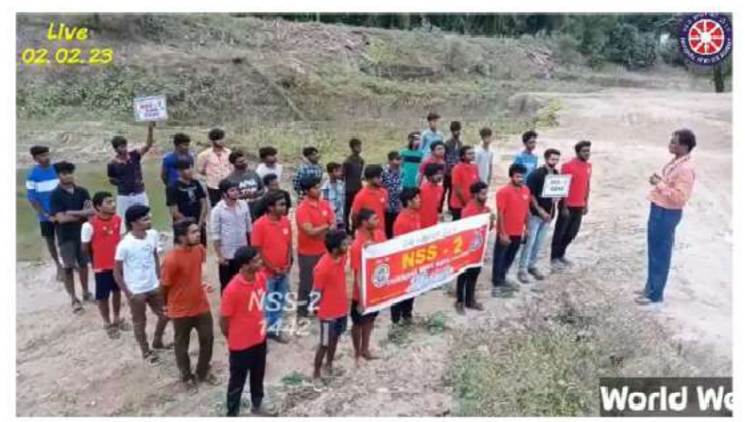
World Wellands Day 2023 | Karumapalayam Special Camp | Sixth Bay | Chikkanna Govt Arts Collage