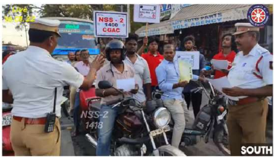
34 th Road Safety Week | South Police Station, Tiruppur | Chikkanna Govt Arts College | NSS Unit II

https://youtu.be/SPIh1V6MWUY?si=fcMuoywpa5m4OsrW