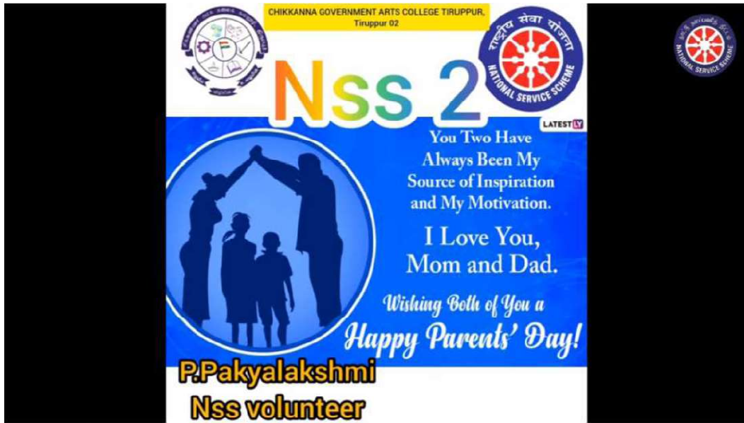
Global Parents Day 2022 | Poster Making | Bharathiar University