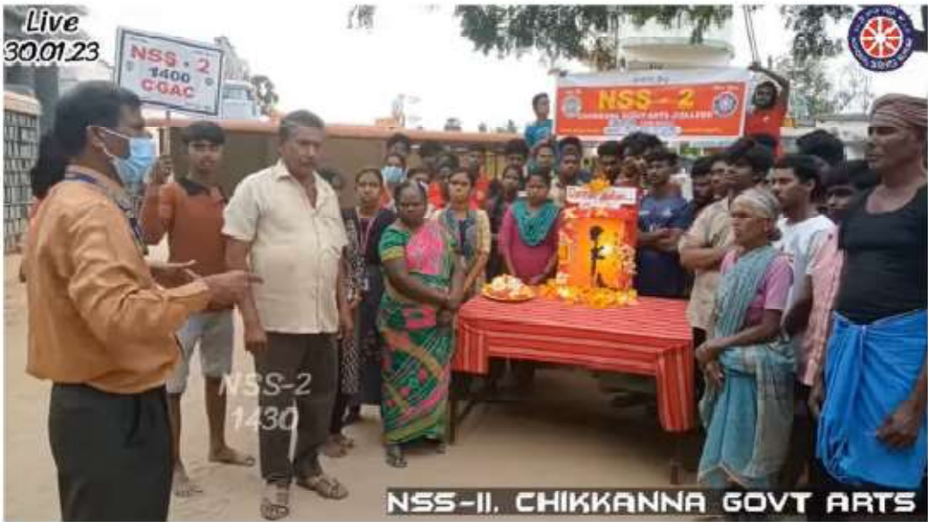
#MartyrsDay | உயிர் தியாகம் செய்த இராணுவ வீரர்களுக்கு புஷ்பாஞ்சலி | 3rd Day |Special Camp 2023|CGAC

https://youtu.be/ziRlwR0n08Y?si=uVhQ03utg7CQ0kNB