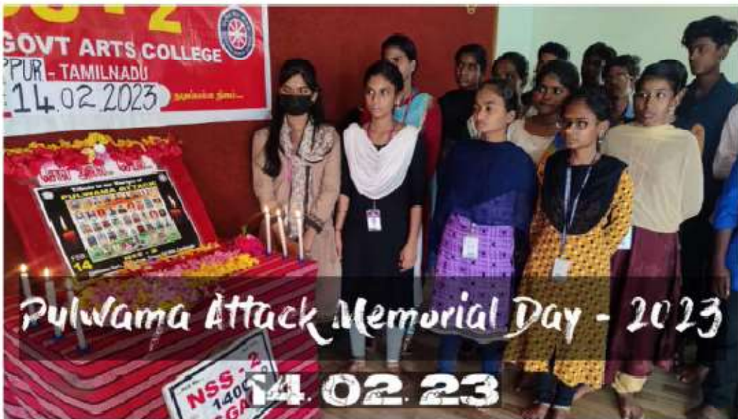
Pulwama Attack Memorial Day 2023 | Floral Tribute and Prayer | Chikkanna Govt Arts College

https://youtu.be/P8KIR5m1wTc?si=jk3x1e1jDWxcOTql