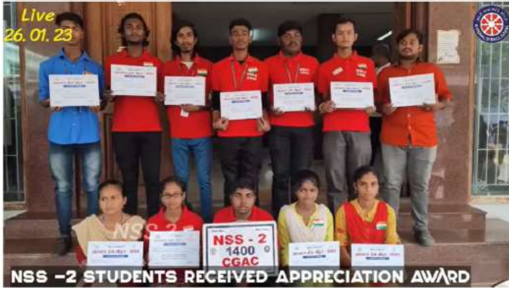
NSS - 2 STUDENTS RECEIVED APPRECIATION AWARD

https://youtu.be/nKsviMGiCTk?si=gP-HtCvmWcqYqvLB