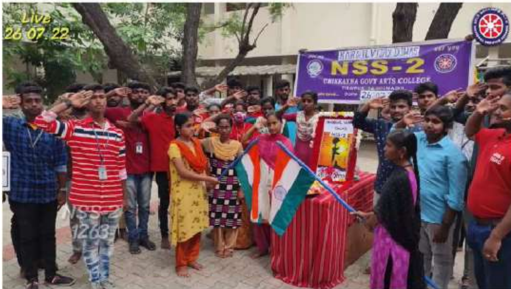
#இந்தியாவின் வெற்றியை யகொண்டாடுவோம் |Kargil VijayDiwas|Chikkanna Govt Arts College|BharathiarUniversity

https://youtu.be/b0oW171h0qc?si=NdblycrWshmfBhLj