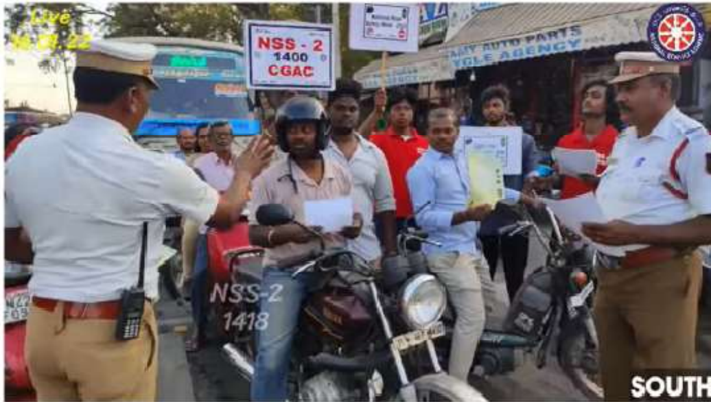
34 th Road Safety Week | South Police Station, Tiruppur | Chikkanna Govt Arts College | NSS Unit III

https://youtu.be/SPIh1V6MWUY?si=fcMuoywpa5m40srW