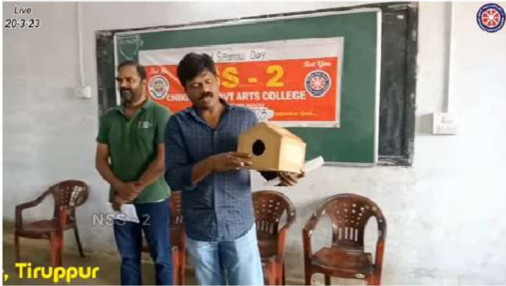
World Sparrow Day 2023 | சிட்டுக்குருவிகள் ஏன் அழிகிறது |Artificial Nest|Chikkanna Govt Arts College