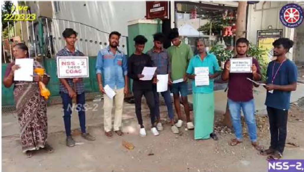
#தண்ணீர்பஞ்சம்வருமா | World Water Day 2023 | Chikkanna Govt Arts College | Tiruppur | NSS

https://youtu.be/88rWVa6wkYU?si=qT4UoS6tPuCjKAA