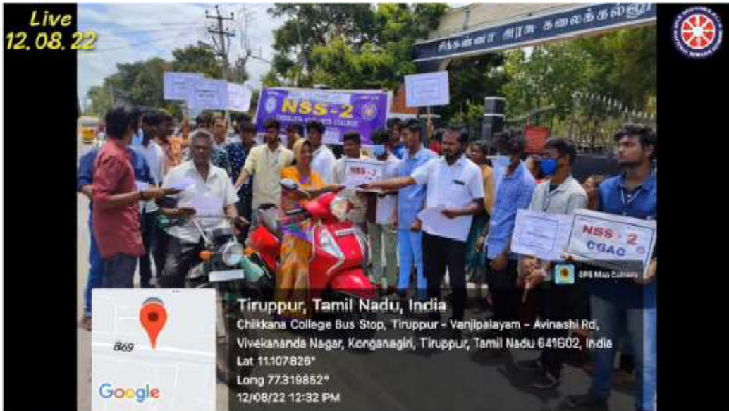
#WildElephant ஏன் யானை மனிதனை தாக்குகிறது | World Elephant Day | Chikkanna Govt Arts College

https://youtu.be/CgKwYGPXak8?si=7Emjs_qu4dzYKffK