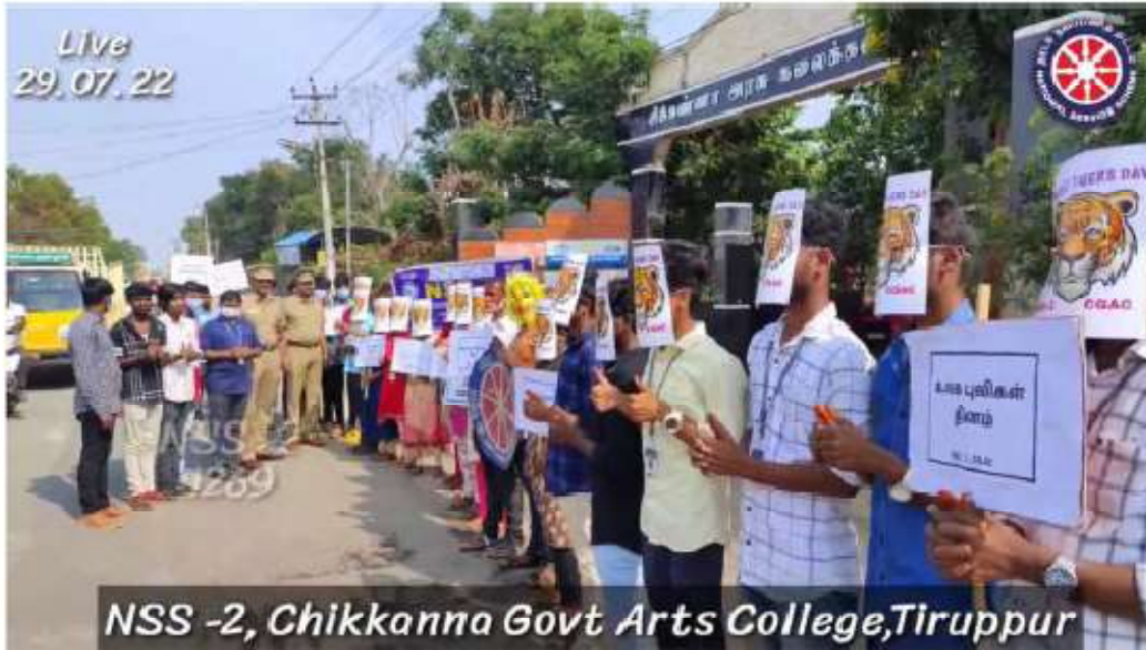
#Tigers புலி வருது புலி வருது | World Tigers Day|Chikkanna Govt Arts College| Bharathiar University