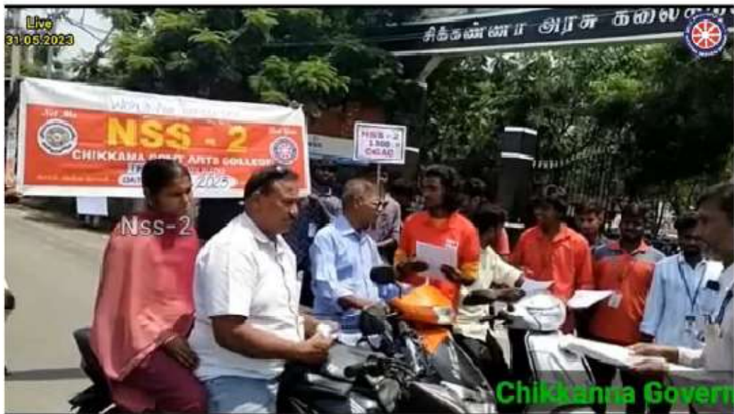
உயிரிழப்பது யார் | World No Tobacco Day | Chikkanna Govt Arts College | Tiruppur | NSS Unit II

https://youtu.be/3yFmapnkCSY?si=M3F7qOEQVuGMcs7I