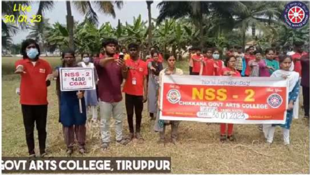
தொழுவதோய் எப்படி பரவும் | World Leprosy Day |Special Camp Karumapalayam |Chikkanna Govt Arts College

Green BOX TAMIL 4,938 subscribers Subscribe 45 Share Download Save