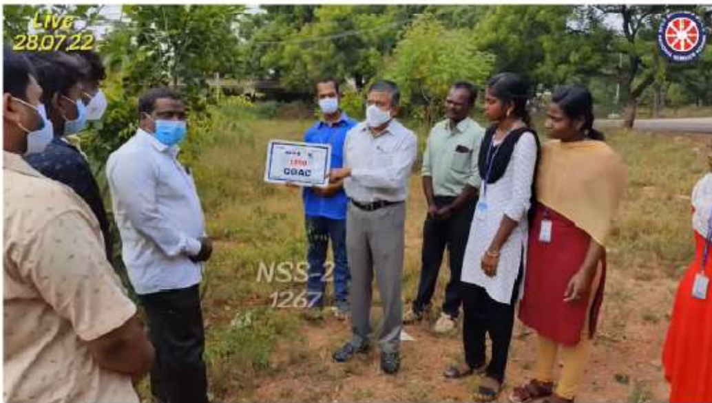
#CampusGreenAudit for NAAC | World Nature Conservation Day | Chikkanna Govt Arts College | Bharathiar

https://youtu.be/ZrRIDLw[v4o?si=TFvR_thzFWm-mzwK