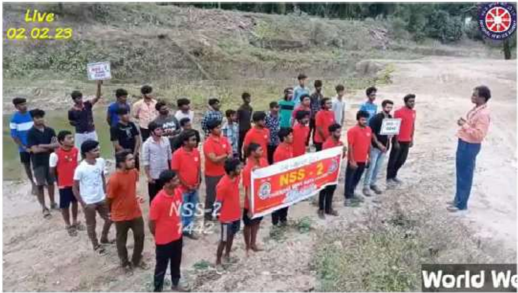
World Wetlands Day 2023 | Karumapalayam Special Camp | Sixth Day | Chikkanna Govt Arts Collage