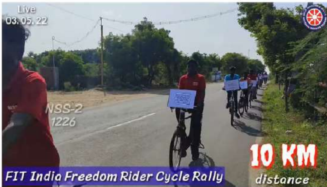
செய்து பார்த்து... அருமை தெரியும் | World Bicycle Day - FIT India Cycle Rally | Bharathiar University

https://youtu.be/UwOTV63utVY?si=6V_mNr82gFQvdfvc