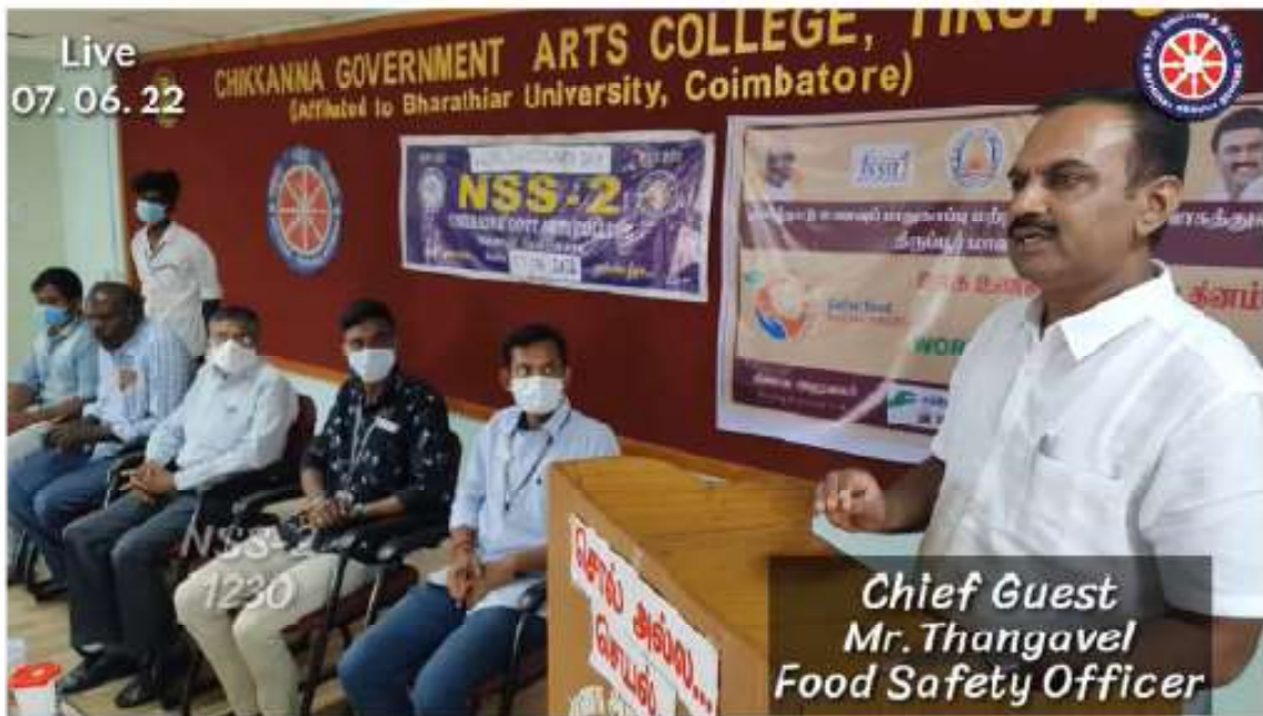
#Shawarma ஆட்டத்திறை உணவுகள் சாஸம் Tamilnadu Food Safety Dept | World Food Safety Day Bharathiar University

https://youtu.be/75hoN7ltj0?si=KBVEaTbWZBwfcHOT