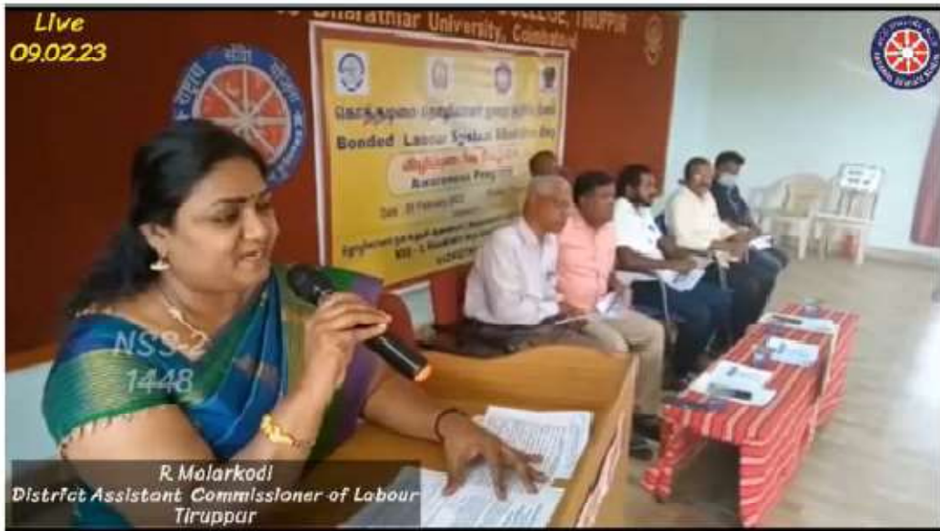
புகைப்படம் [Bonded Labour System Abolition Day 2023] Chikkanna Govt Arts College | Malarkodi