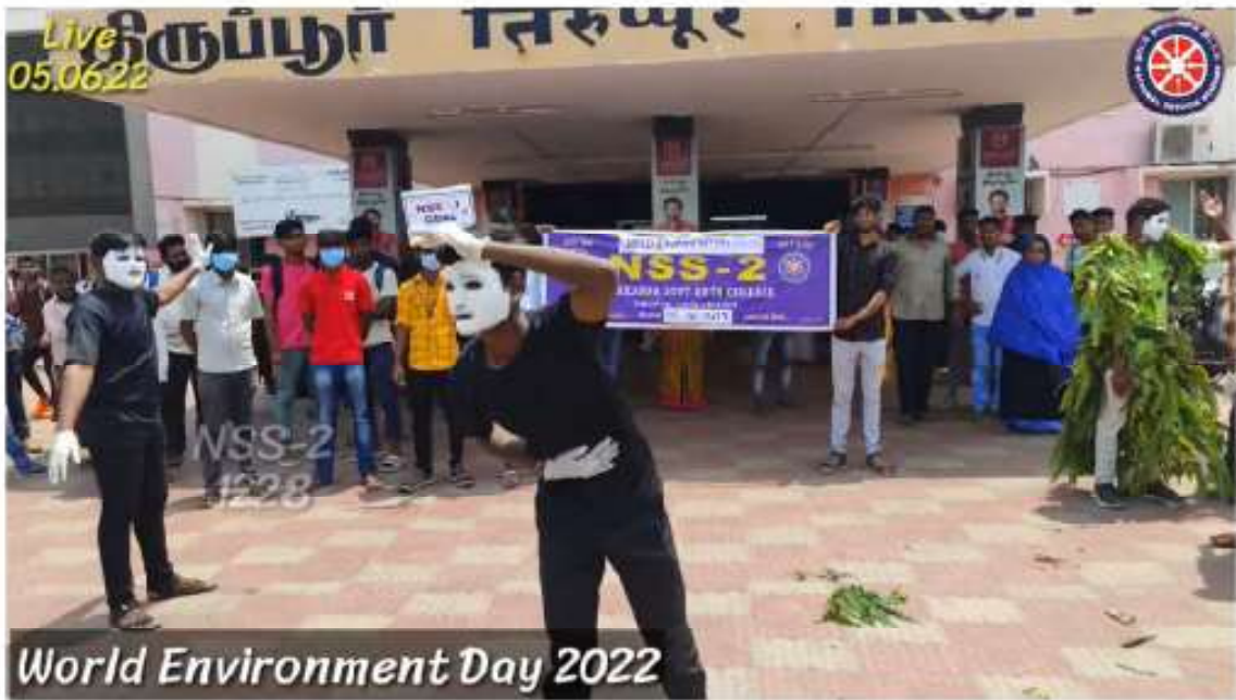
#Mins 5k: இவியாவது திருந்துவார்களா | World Environment Day | Southern Railway | Bharathiar University