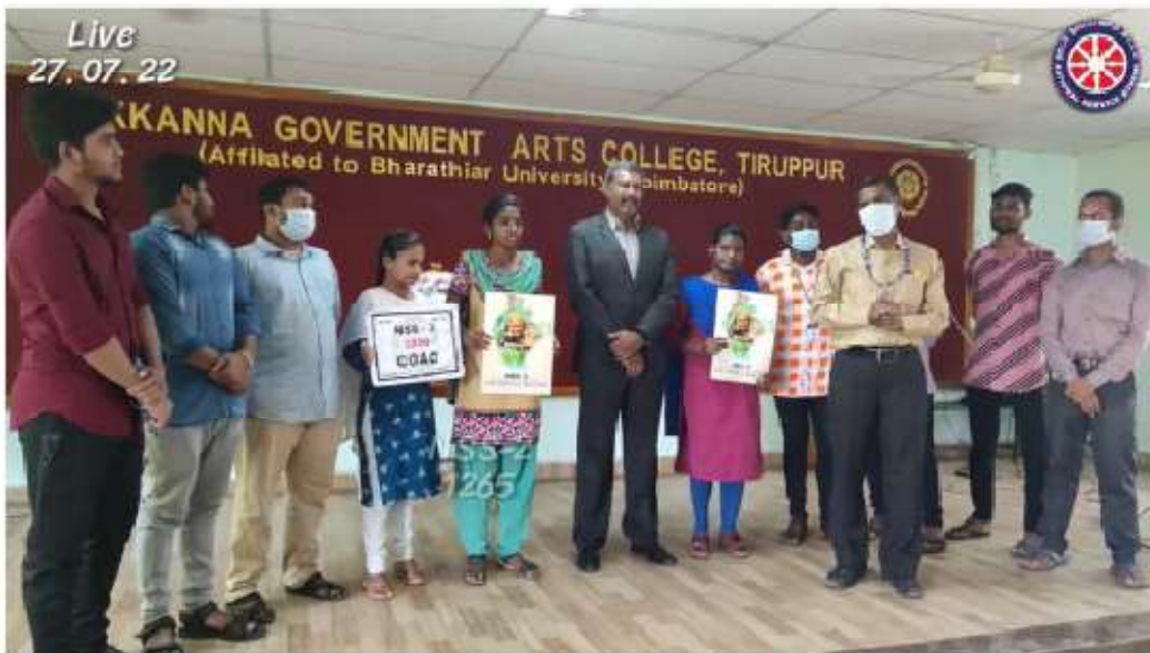
APJ Abdul Kalam's Death Anniversary 2022 | Tiruppur Chikkanna Govt Arts College | Bharathiar University