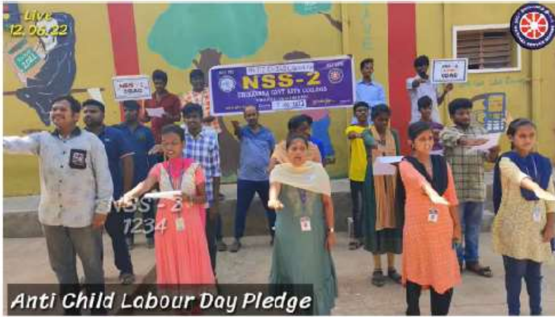
குழந்தைகளை பள்ளிக்கு அனுப்புவோம் | Anti Child Labour Day | Pledge | கல்வி | Bharathiar University