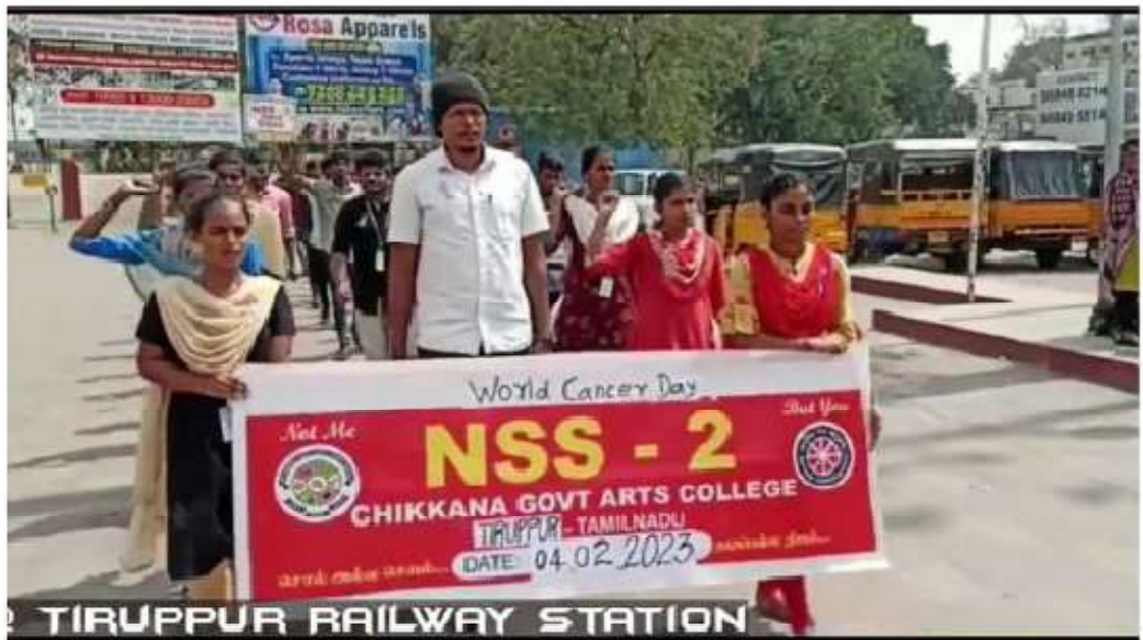
World Cancer Day 2023|உலககடற்றுநோய் இனம்|TiruppurCorporation&Railway Station |ChikkannaGovtCollege

https://youtu.be/kmlgSf-Dfw?si=fEU9yCY1Z-mG.15zL