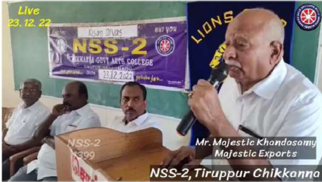
தலைமுறை அழிந்து விடும் | Kishan Divas | National Farmers Day | Chikkanna Govt Arts College