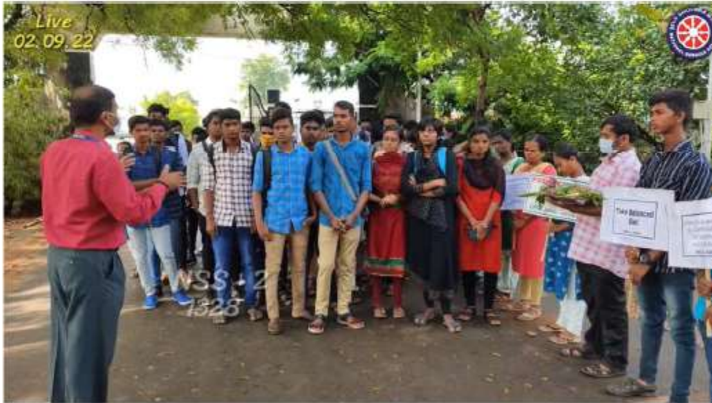
சுகந்தரணிய உணவு சாப்பிடலாம் | National Nutritional Day | Take Balanced Diet | Chikkanna Govt Arts College

https://youtu.be/hKblvjl6d5Q?si=nEJAM-VAq1KNhrzE