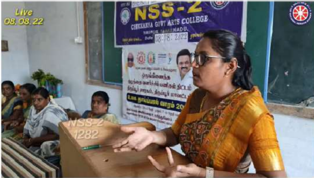
#BreastMilk தாய்ப்பால் வாரம் | World Breast Feeding Awareness Week | Chikkanna Govt Arts College