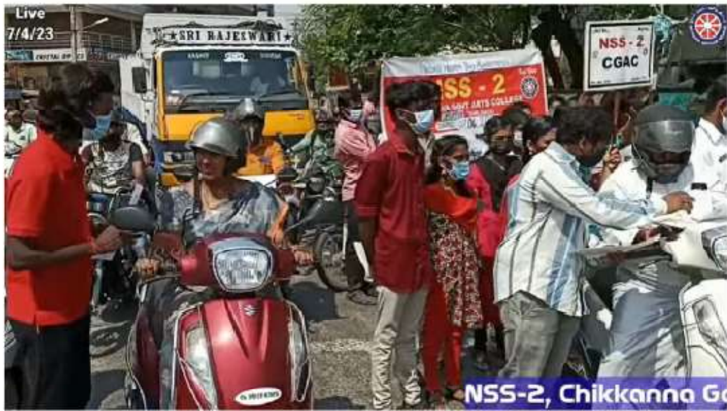
தேரையற்ற வாழ்வே குறைபற்ற செல்வம் | World Health Day Awareness | Chikkanna Govt Arts College | Tiruppur