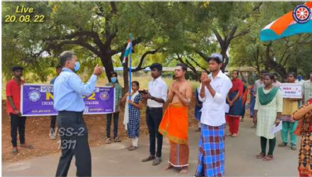
சகல்தாரிமாணவர்களின் செயல் 'தவறாள் பார்க்கவும்' | Sadbhavana Diwas | Chikkanna Govt Arts College